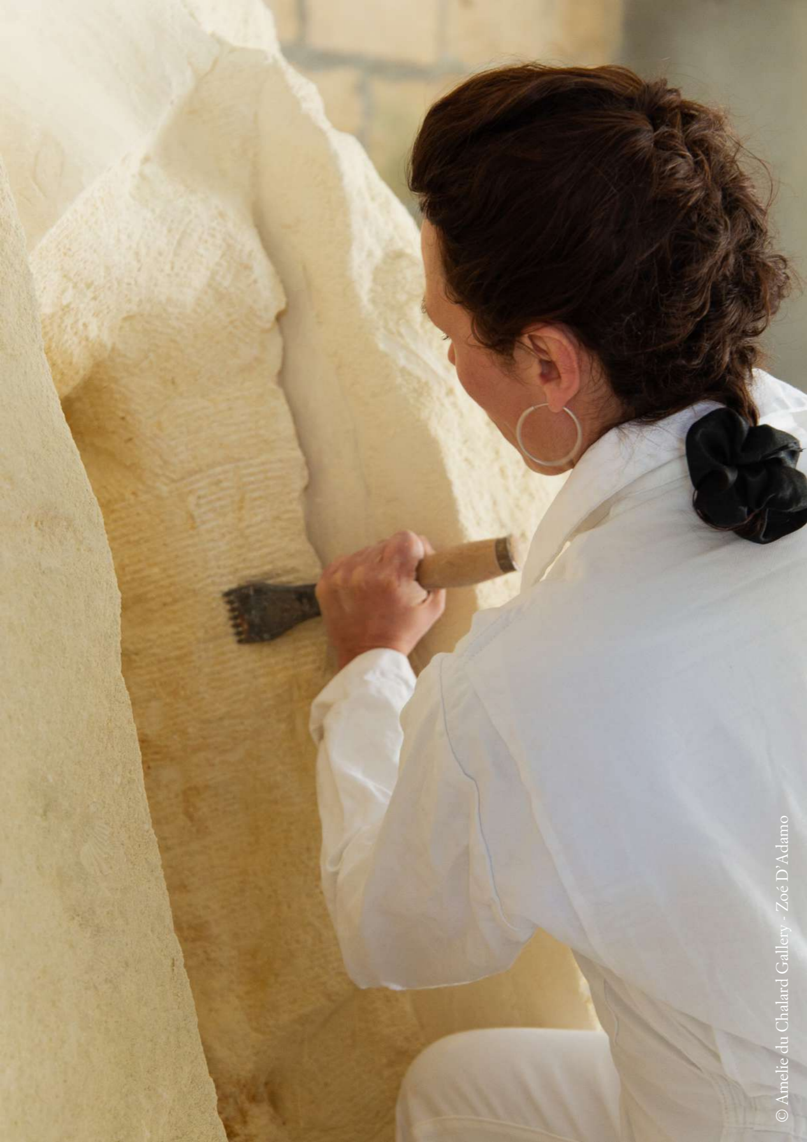
© Amélie du Chalard Gallery - Zoé D'Adamo